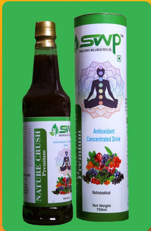
Nutraceutical Antioxidant Concentrated Drink