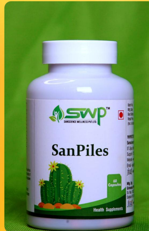
SanPiles Health Supplements