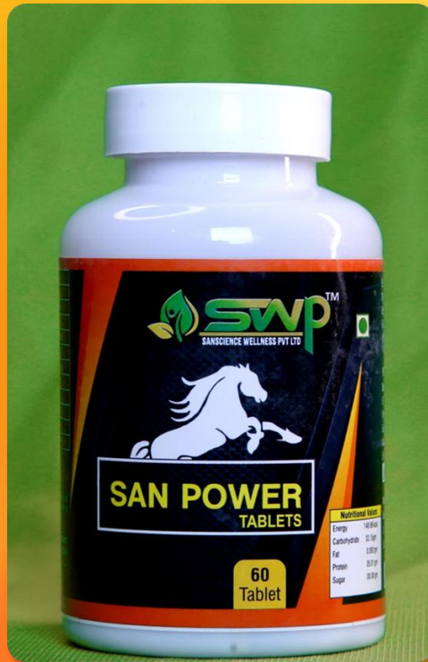
San Power Tablets